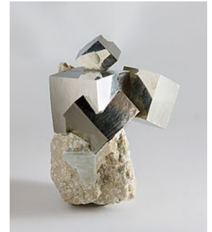
Pyrite from Ampliación a Victoria Mine, Navajún, La Rioja, Spain