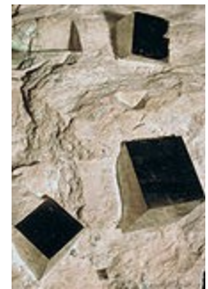
Cubes in rock

Do you have an expertise in something—why not give a program.