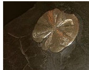
Disc or "pyrite dollar"