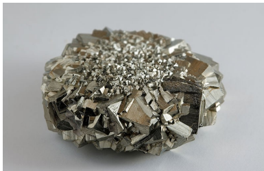
A mass of intergrown pyrite crystals

Look here for more information. http://en.wikipedia.org/wiki/Pyrite